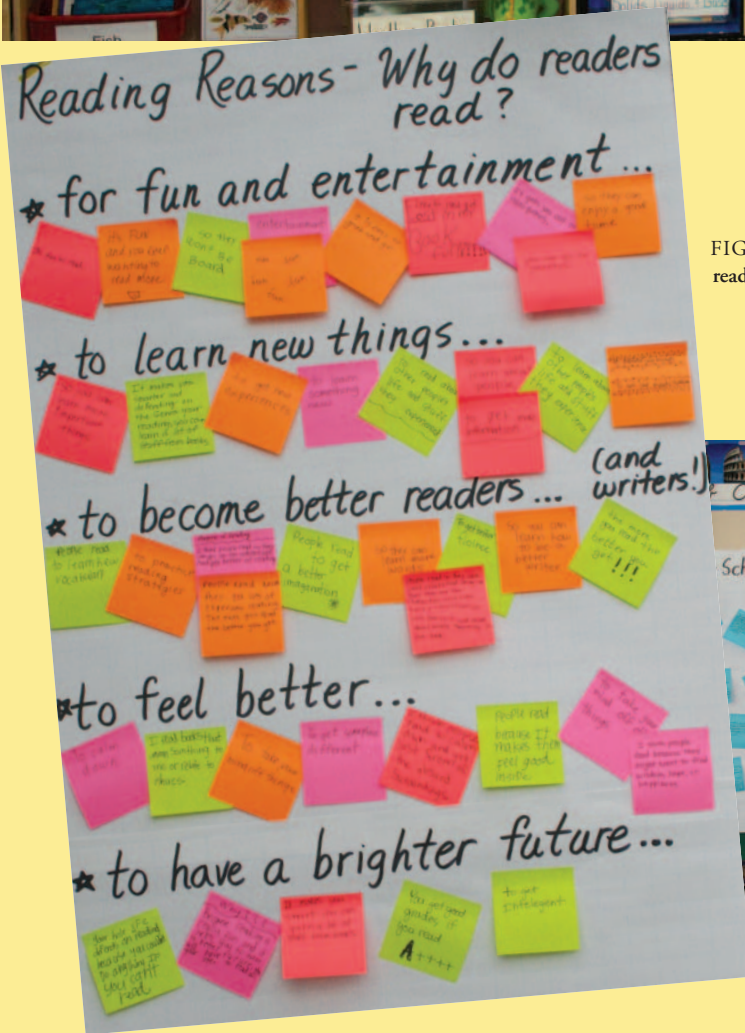
FIGURE 1.2 Student responses (on sticky notes) to the question, "Why do readers read?" Students organized their responses and defined the subtitles.