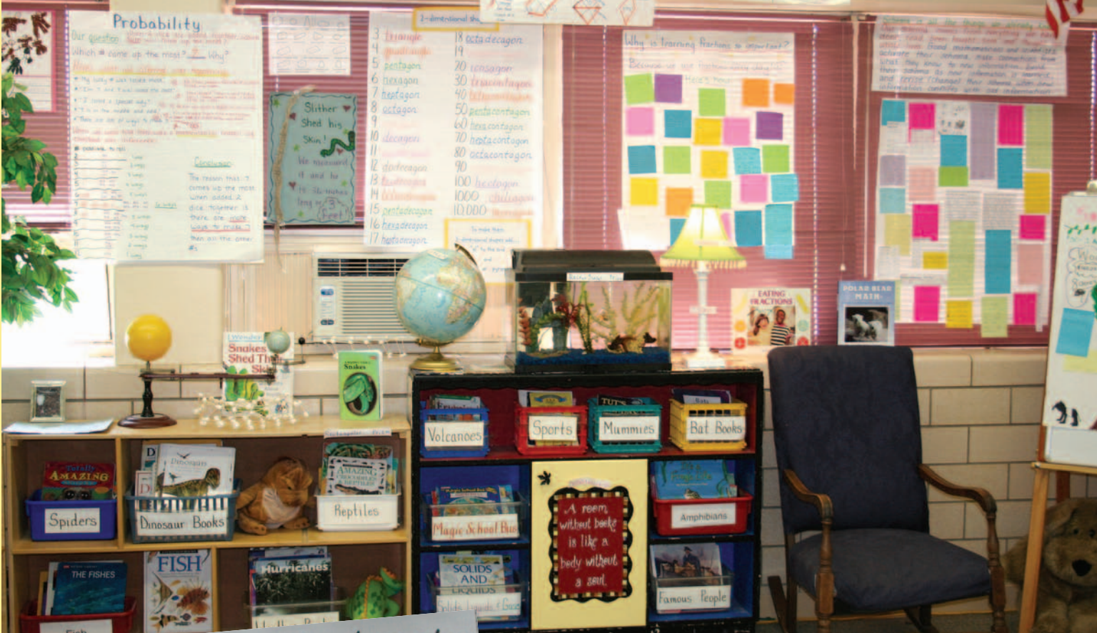
FIGURE 1.1 Literate and purposeful, organized and accessible, and most of all authentic? You bet!